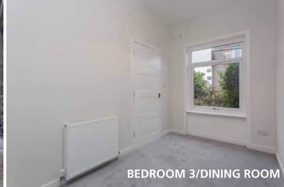
BEDROOM 3/DINING ROOM