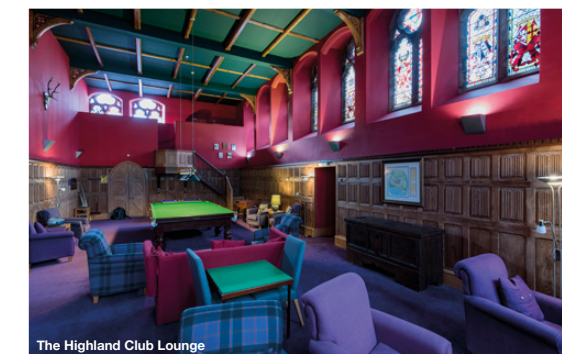
The Highland Club Lounge