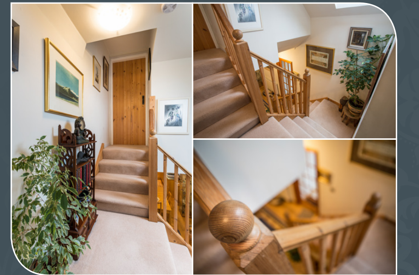
Kitchen/Family/Dining Area & Stairway

The hub of the home is the magnificent open plan kitchen/family/diner, which has been beautifully fitted to include an excellent range of floor and wall mounted units with a striking charcoal worktop, providing a fashionable and efficient workspace. It further benefits from a Flavel Milano range cooker and an integrated dishwasher and fridge, making this the ideal kitchen for an aspiring chef. There is ample room for a large table for more informal dining with friends and family. From the kitchen, there is access to the utility room, which is plumbed for a washing machine and tumble dryer and has space in an upright fridge freezer. A personal door leads out to the garden and patio.