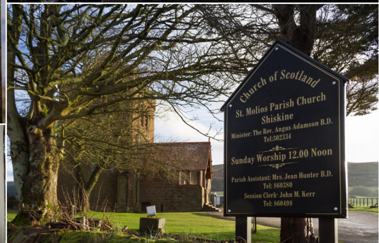
Scenes of Blackwaterfoot, St Molios Parish Church and the Surrounding Coastline