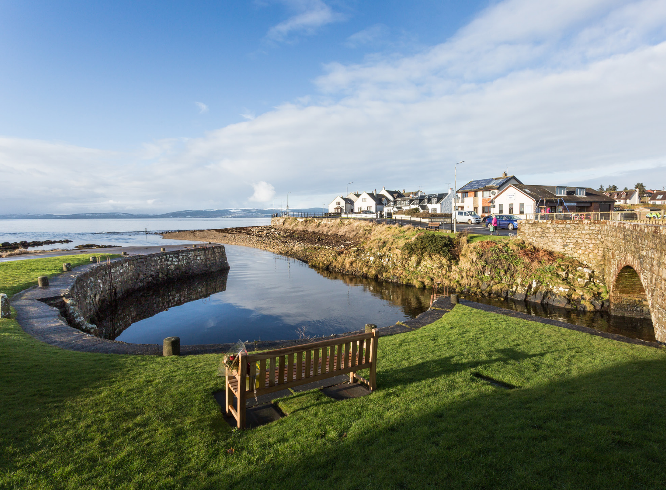
Scenes of Blackwaterfoot