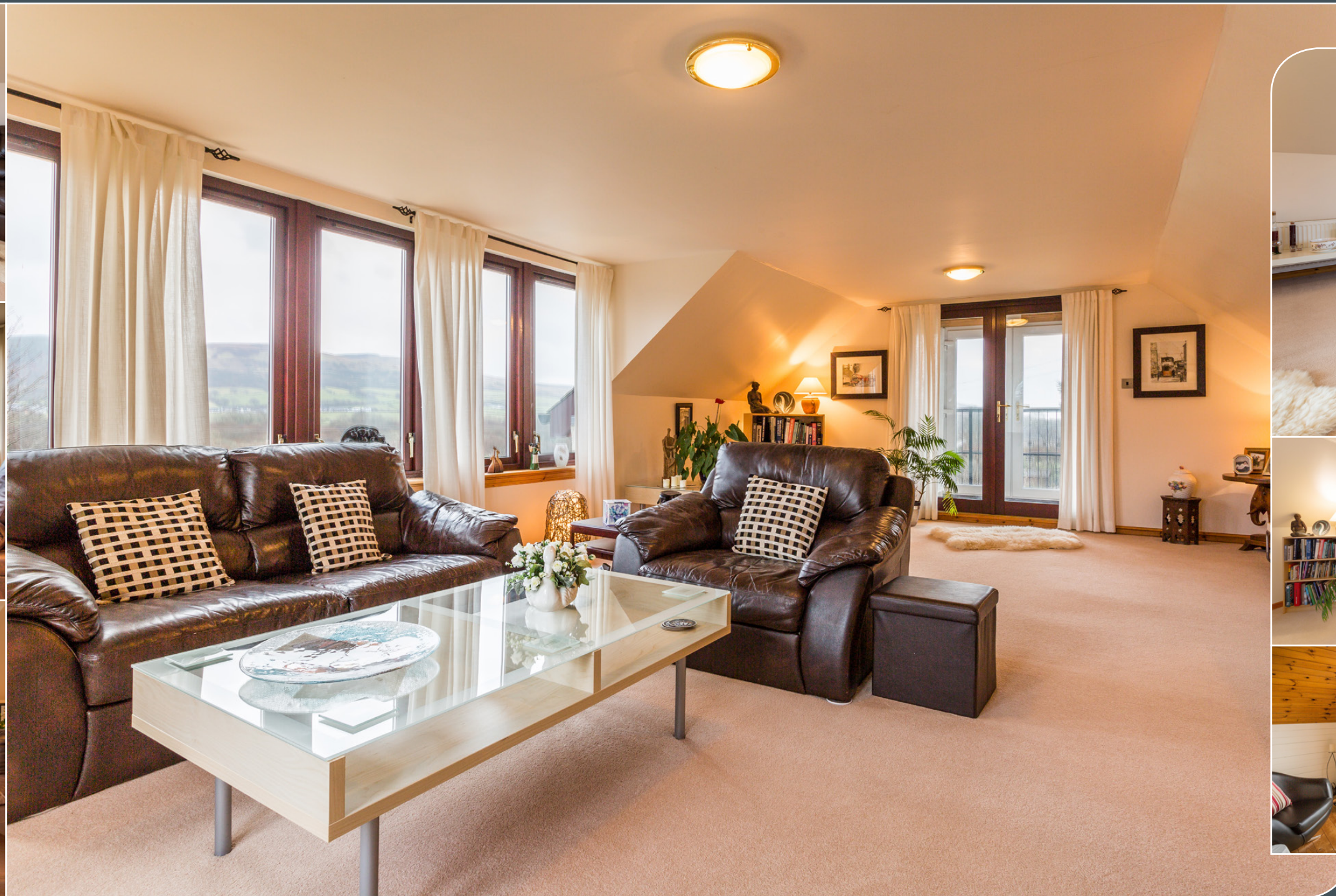
First-Floor Lounge & Sun Room