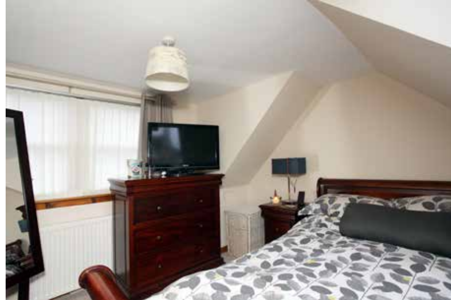
Bedrooms and Shower Room