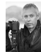
Professional photography ANDY SURRIDGE Photographer