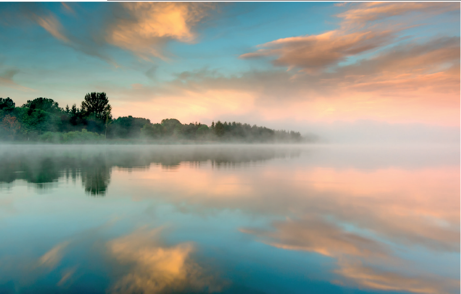
LOCATION IMAGES: FORFAR LOCH, FORFAR TOWN CENTRE, GLAMIS CASTLE & BALGAVIES LOCH