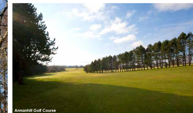
Annanhill Golf Course