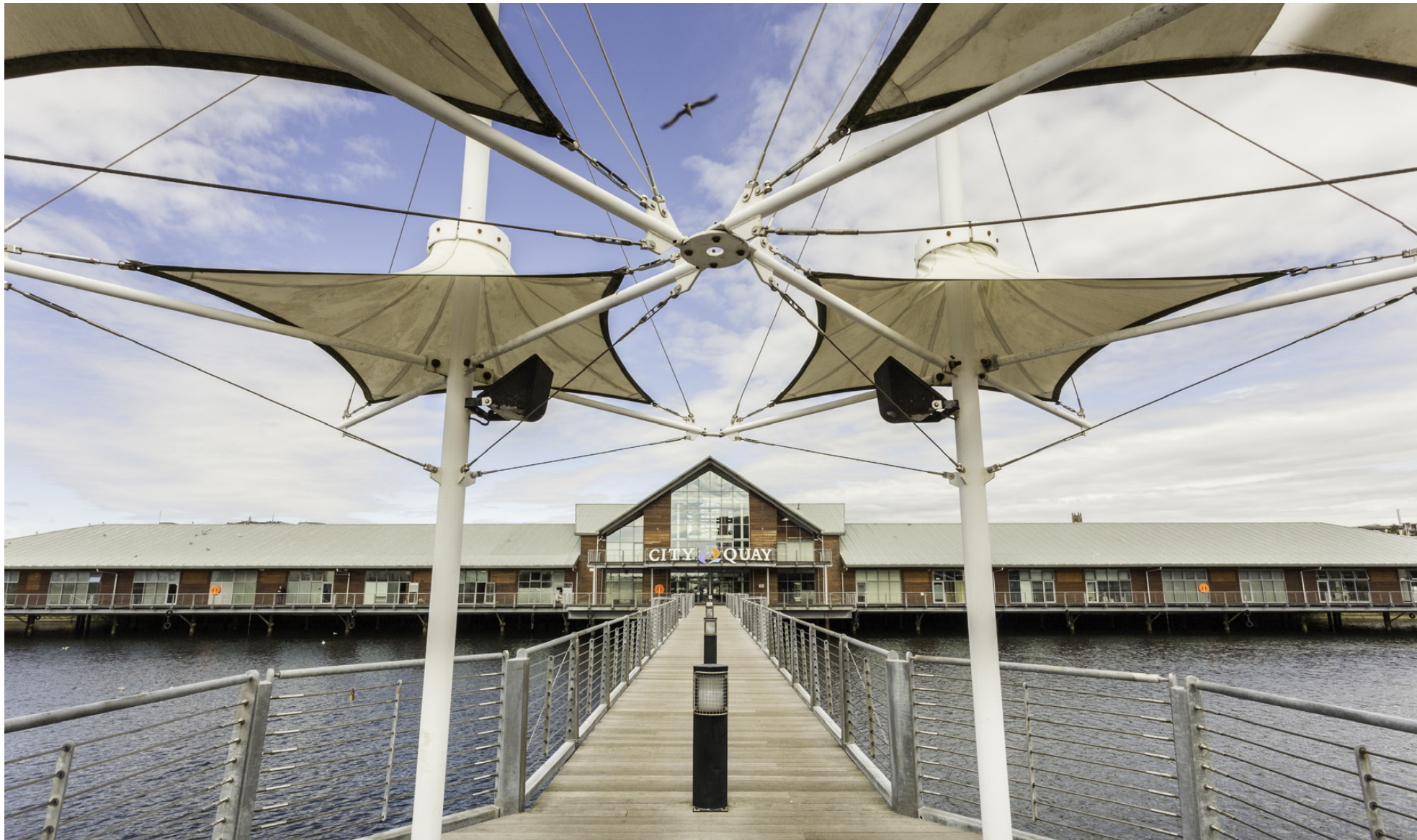
City Quay, Tay Rail Bridge, Seabraes Bridge/Dundee Waterfront and Seabraes Lemmings