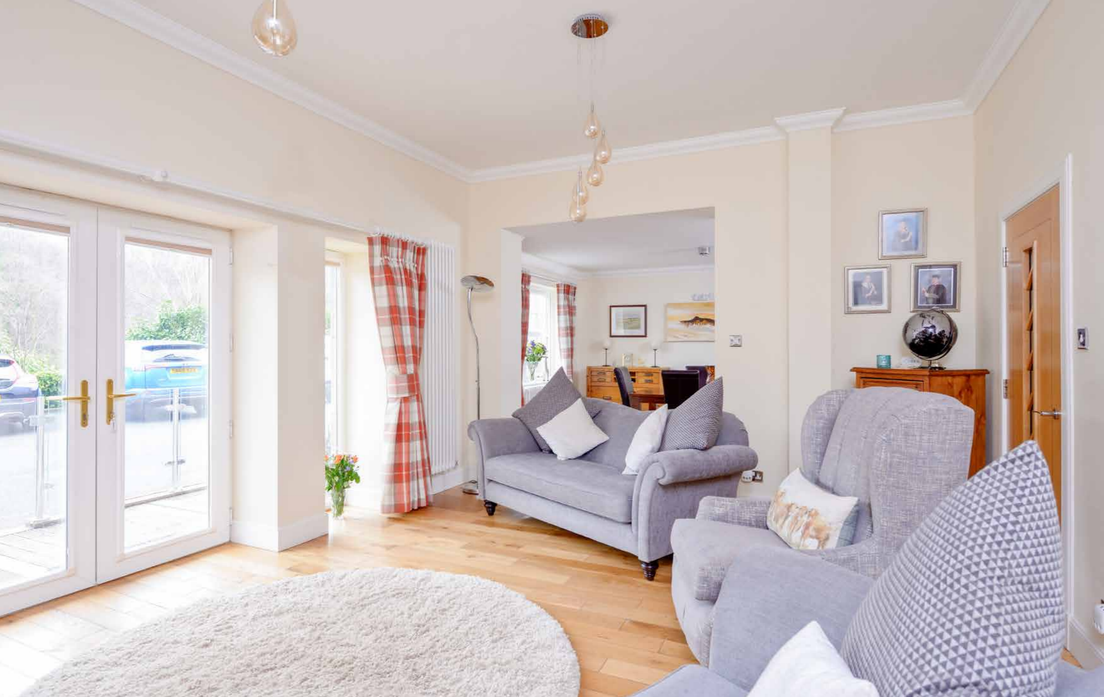
1 The Riverview EDINGTON MILL, DUNS

“...the sheer scale of the lounge and the attached dining room. Neutrally decorated and finished with strip wood flooring, this is a naturally bright and engaging space...”