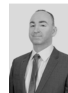
Professional photography ROSS MCBRIDE Photographer