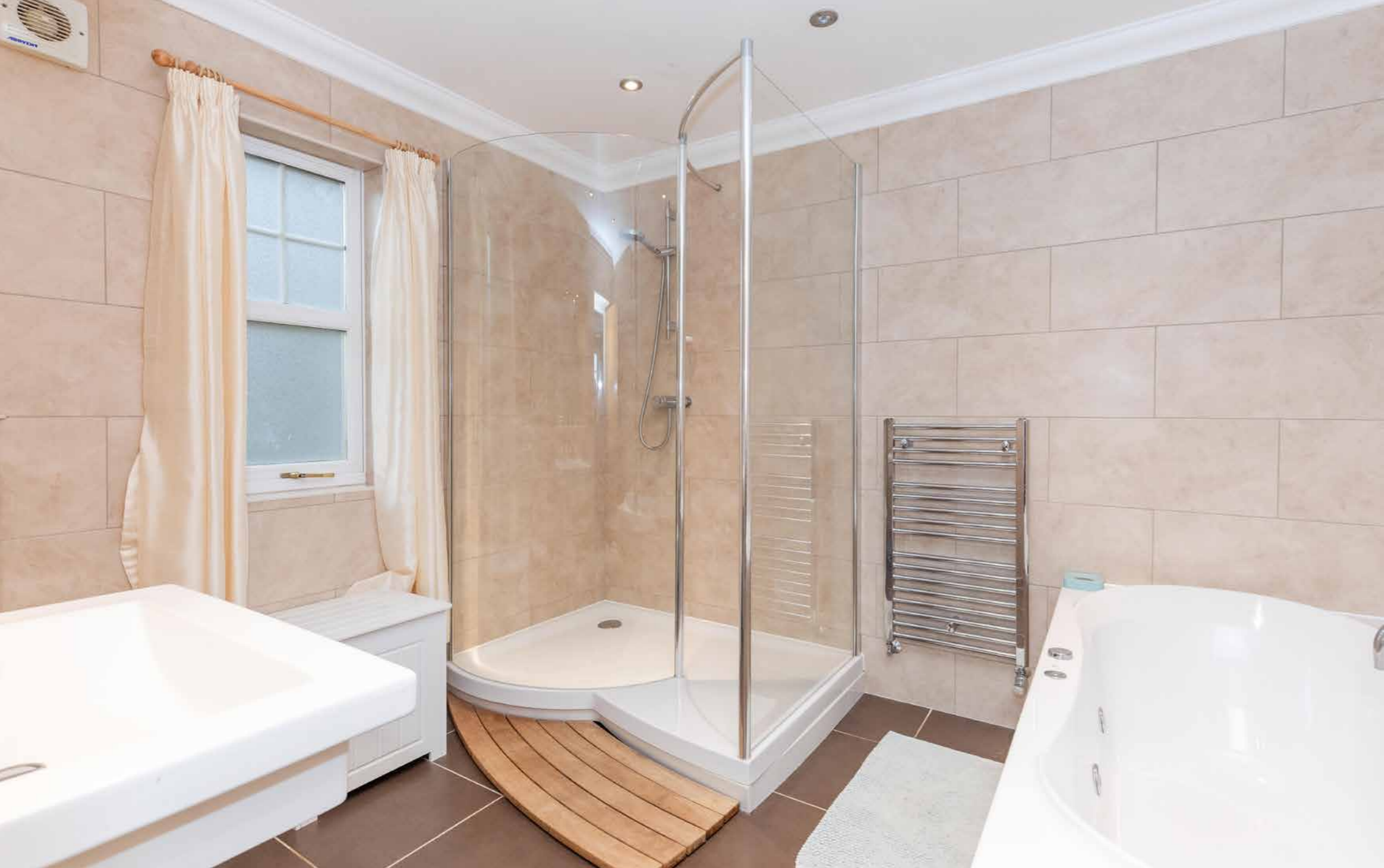
1 The Riverview EDINGTON MILL, DUNS

Approximate Dimensions (Taken from the widest point)