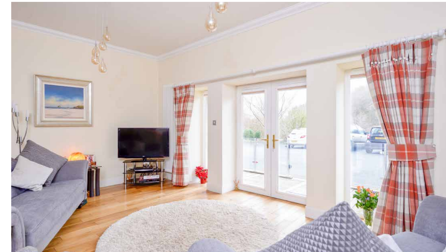
1 The Riverview EDINGTON MILL, DUNS