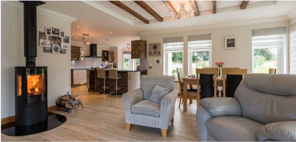
open plan area