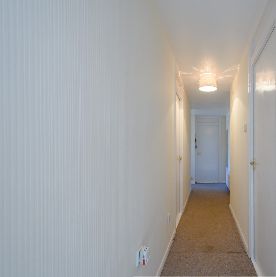
hall & bathroom