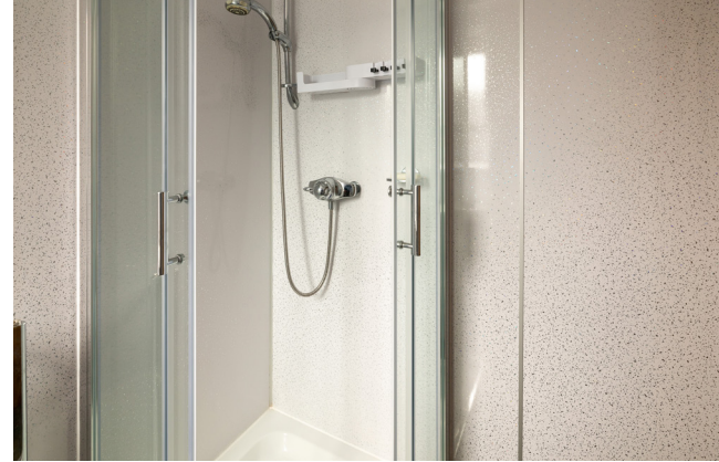
Bedroom & Bathroom