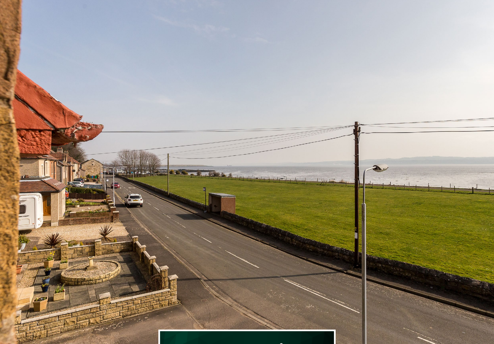
Bedroom 1 Views