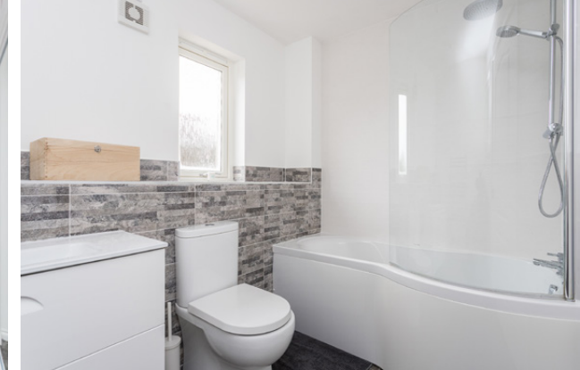
BEDROOMS, BATHROOM, EN-SUITE & WC