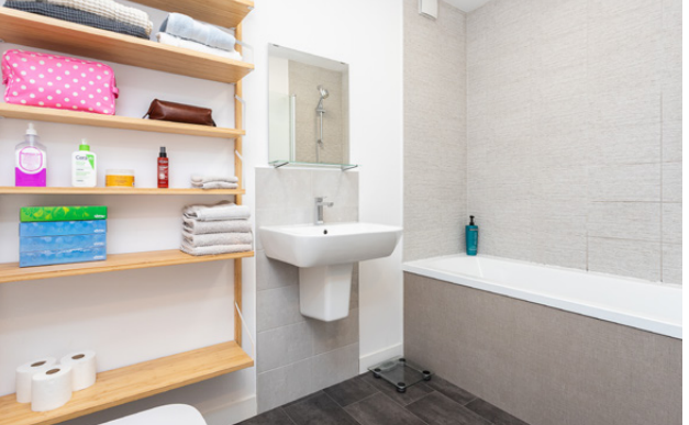
bedrooms & bathroom