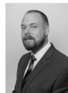
Professional photography GRANT LAWRENCE Photographer