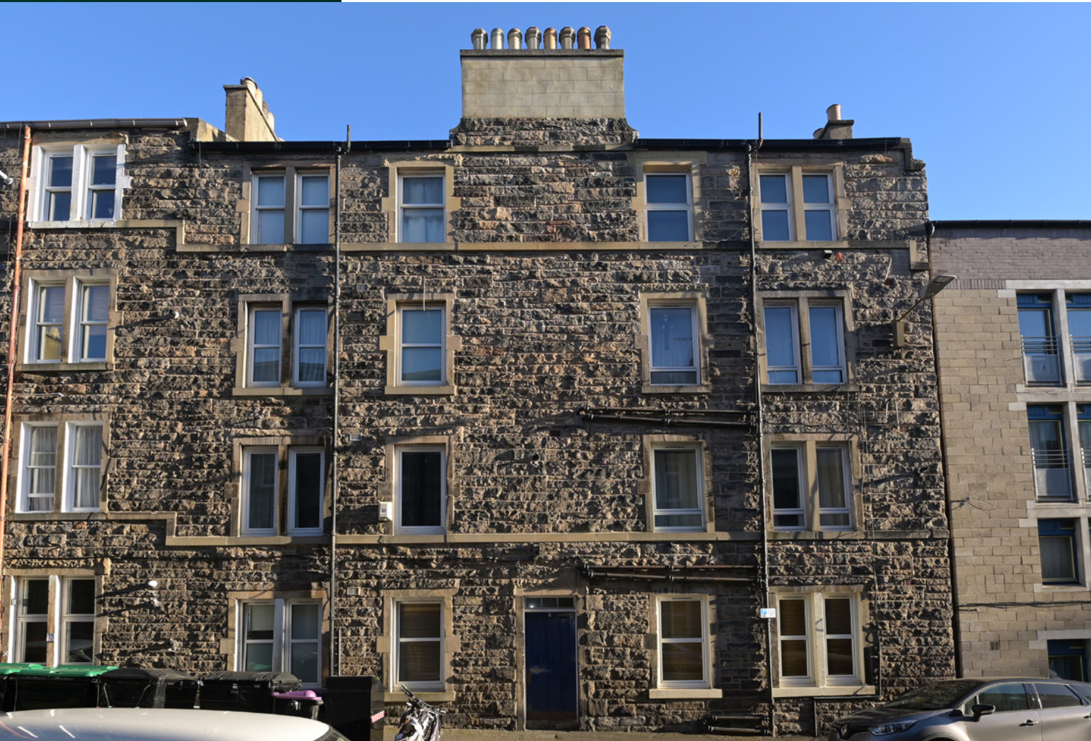
Stylish One-Bedroom Flat on Lyne Street, Abbeyhill