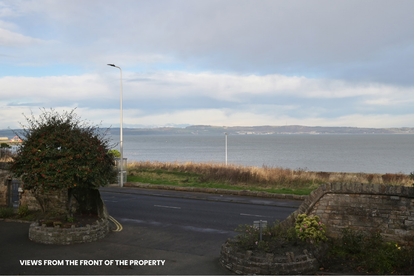
VIEWS FROM THE FRONT OF THE PROPERTY