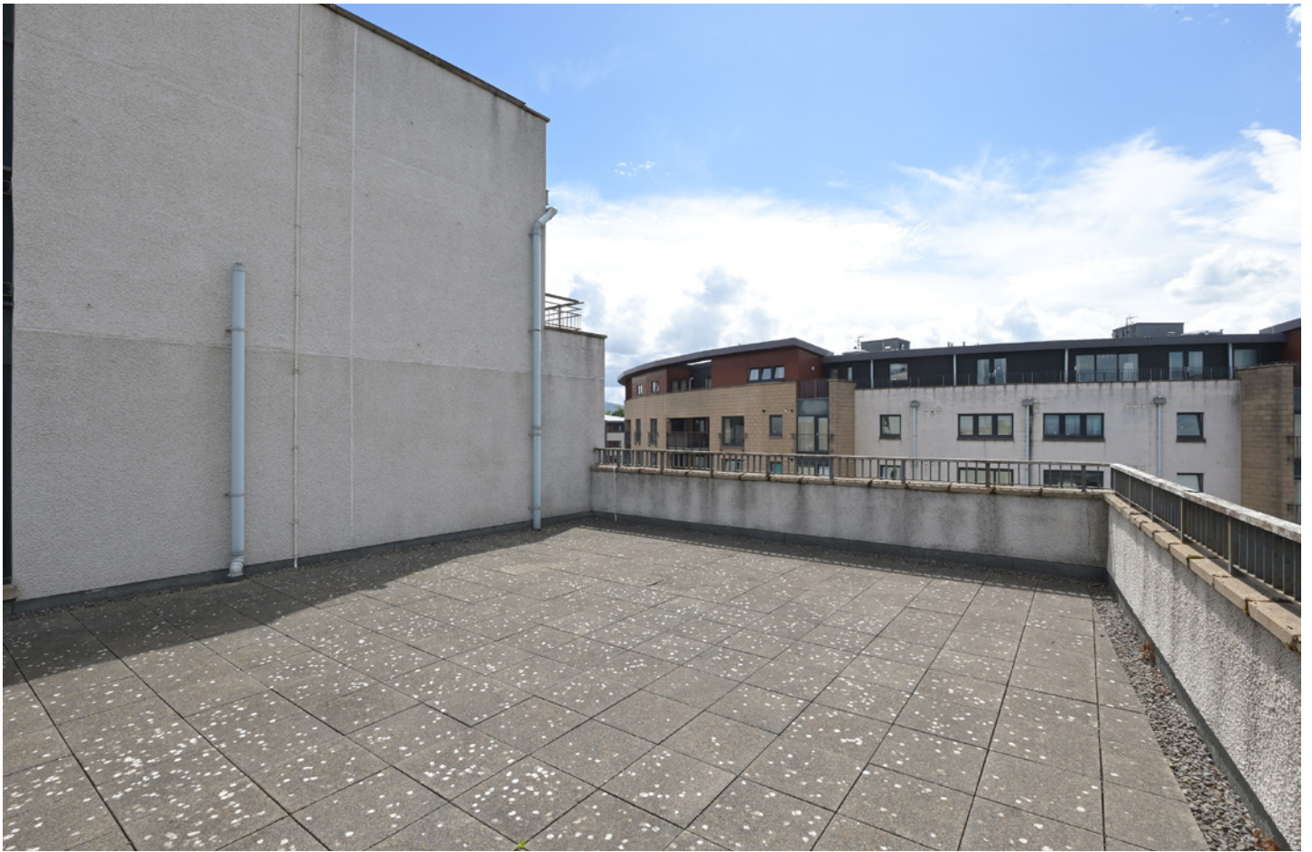
Lovely coastal scenery can be viewed via the rooftop terrace.