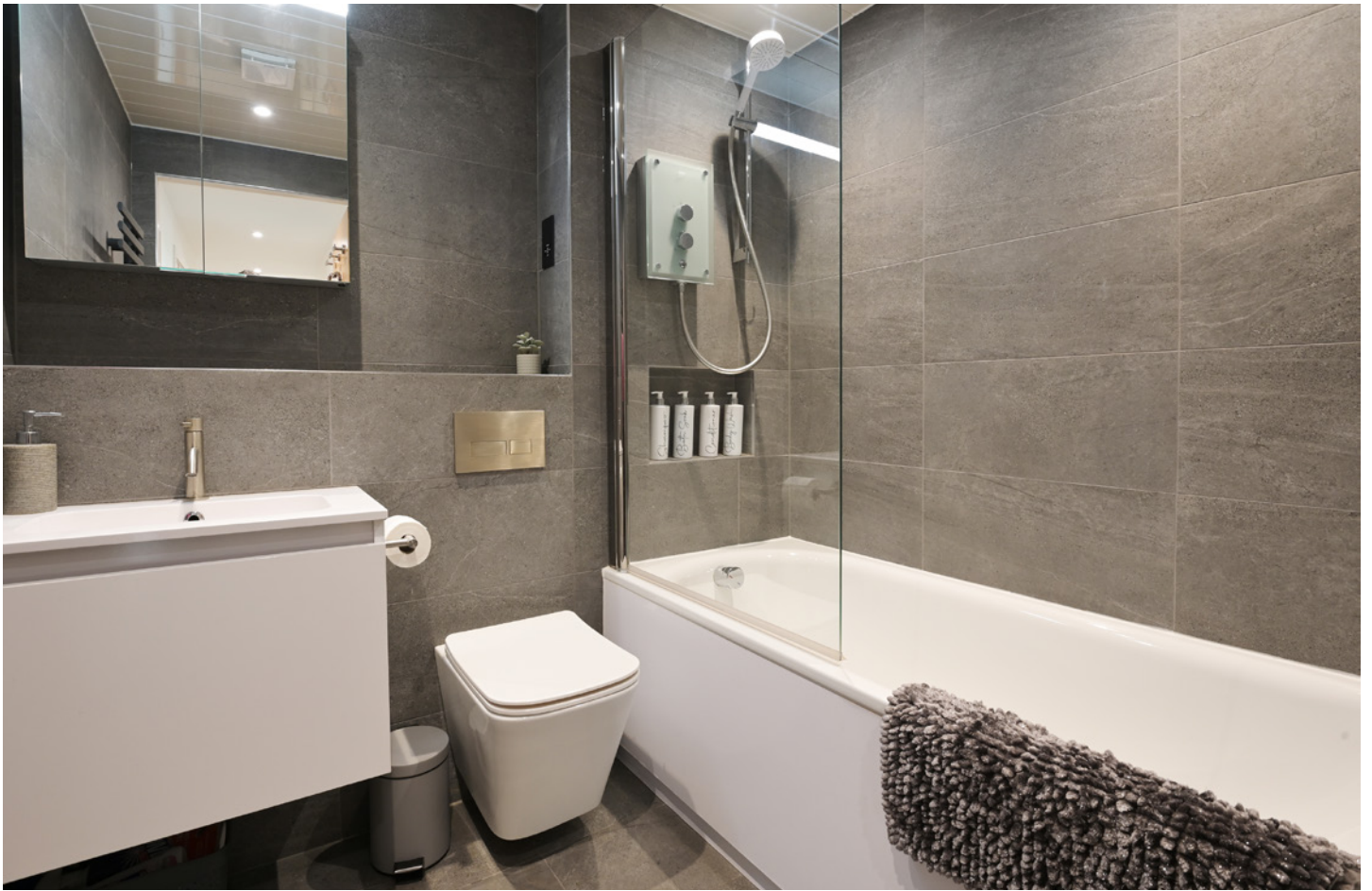
The internal accommodation is completed by a beautiful bathroom which is fully tiled and includes a contemporary three-piece suite with a shower over the bath.