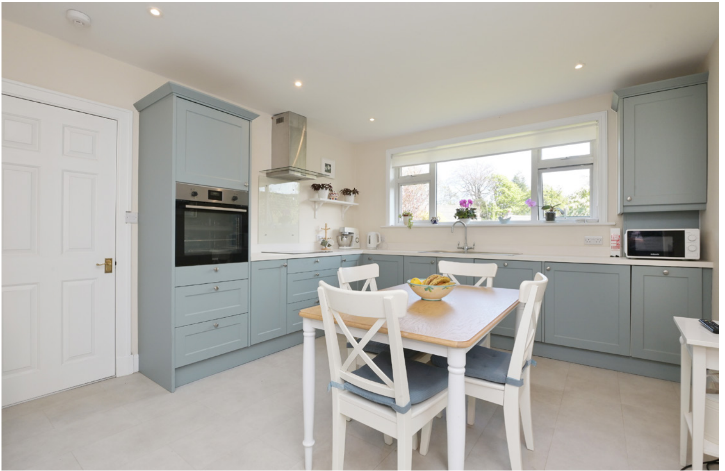
The breakfasting kitchen is fitted with a range of wall and base units together with integrated appliances, and offers ample space for informal dining.