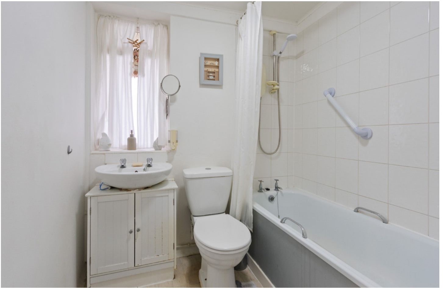
The family bathroom is finished in a neutral colour palette with white tiling and comprises a three-piece suite.