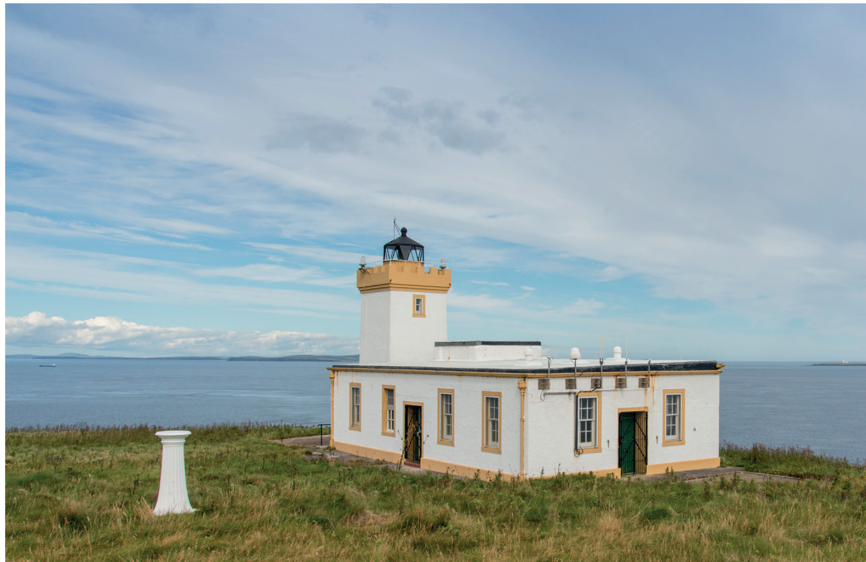
DUNCANSBY HEAD LIGHTHOUSE & JOHN O GROATS HOTEL.