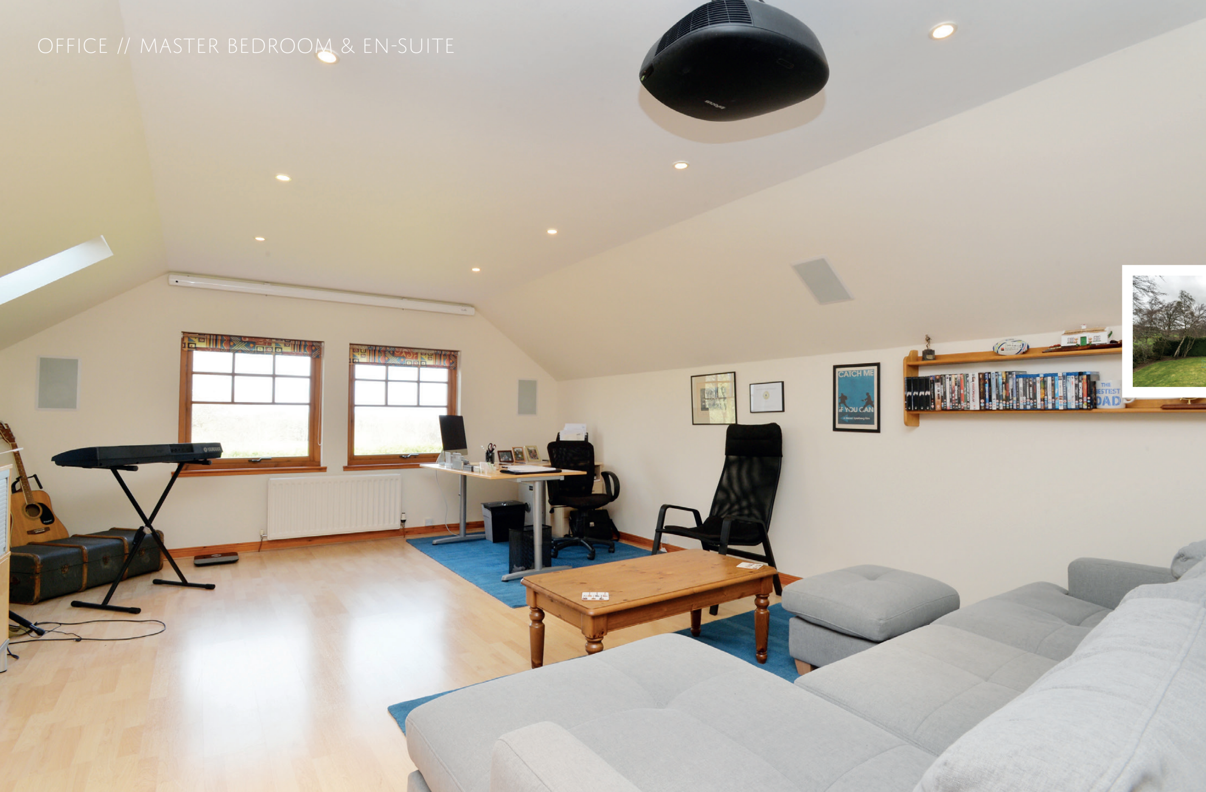
OFFICE // MASTER BEDROOM & EN-SUITE