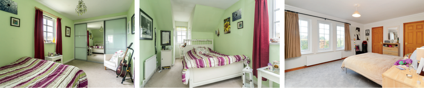
BEDROOMS // EN-SUITE // BATHROOM // WC