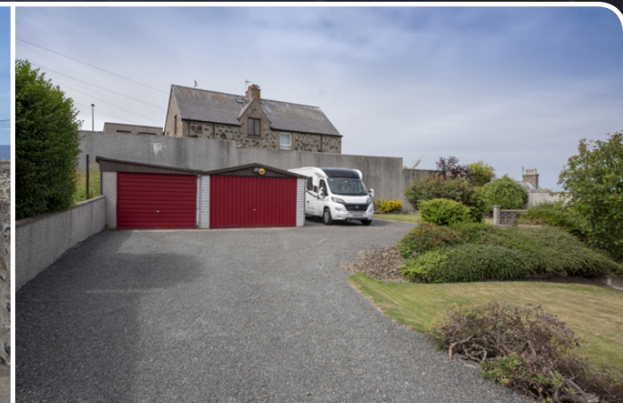
Scenic views of Macduff Bay & Views from the property