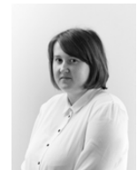
Layout graphics and design ABBEY TURPIE Designer