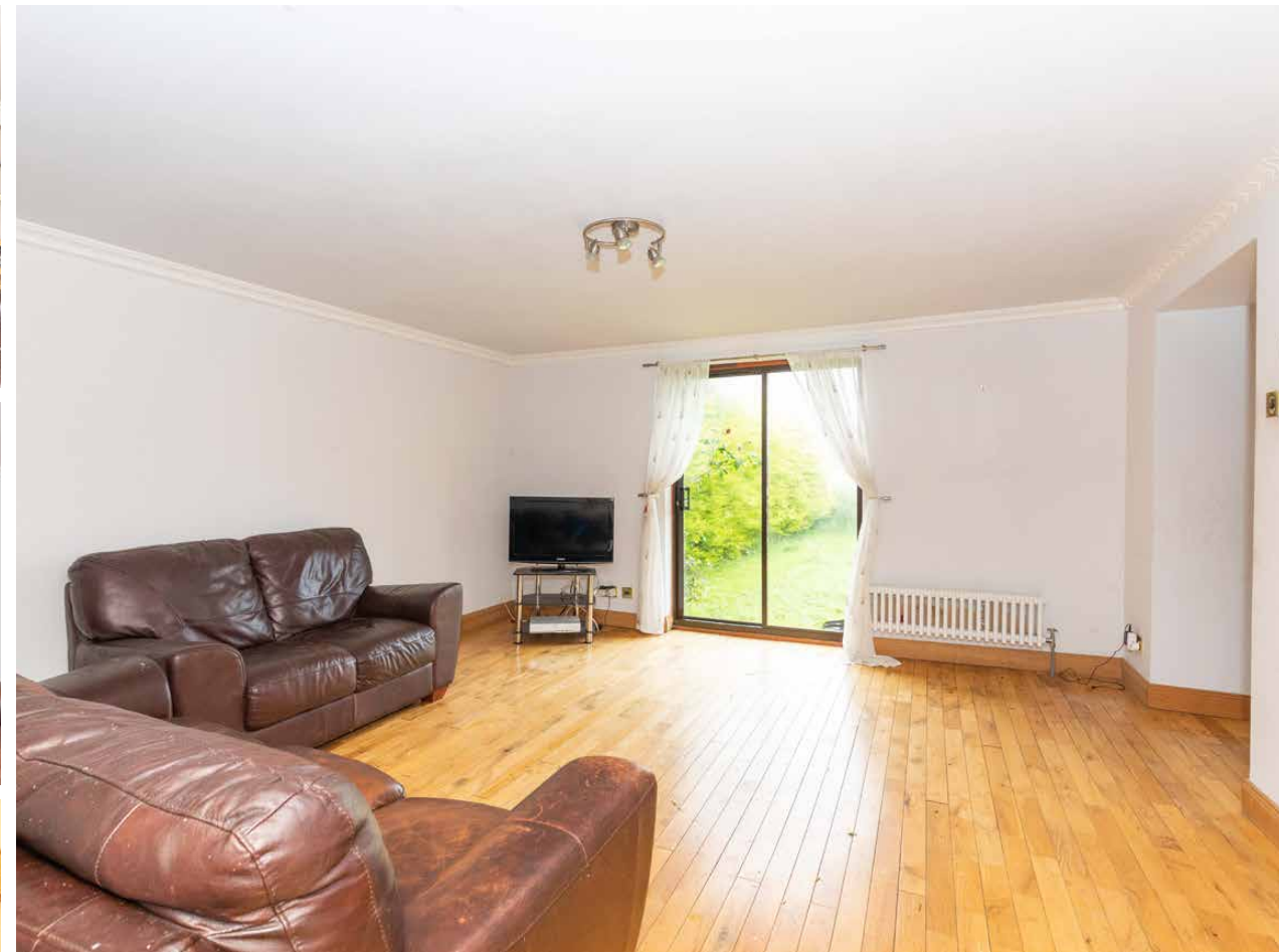
Lounge, Kitchen & Hallway