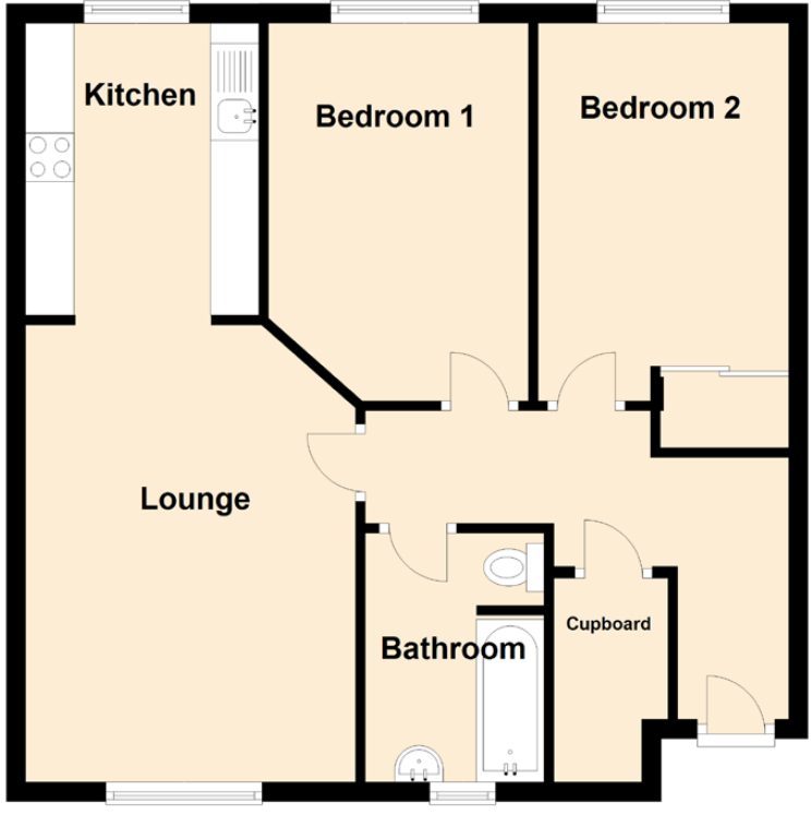
Approximate Dimensions (Taken from the widest point)

Lounge4.72m (15'6") x 3.41m (11'2")Kitchen3.01m (9'11") x 2.41m (7'11")Bedroom 13.92m (12'10") x 2.69m (8'10")Bedroom 23.72m (12'2") x 2.59m (8'6")Bathroom2.57m (8'5") x 1.85m (6'1")