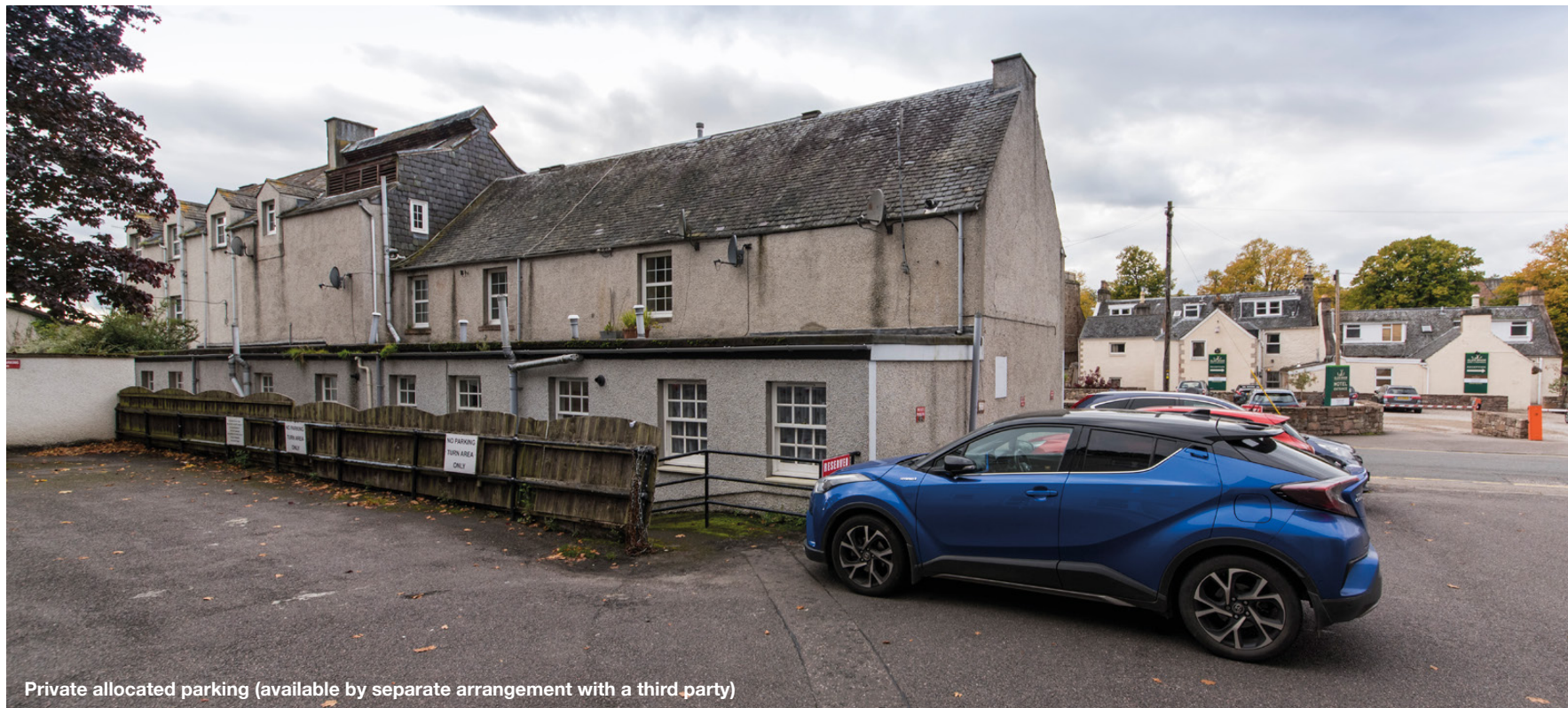
Private allocated parking (available by separate arrangement with a third party)