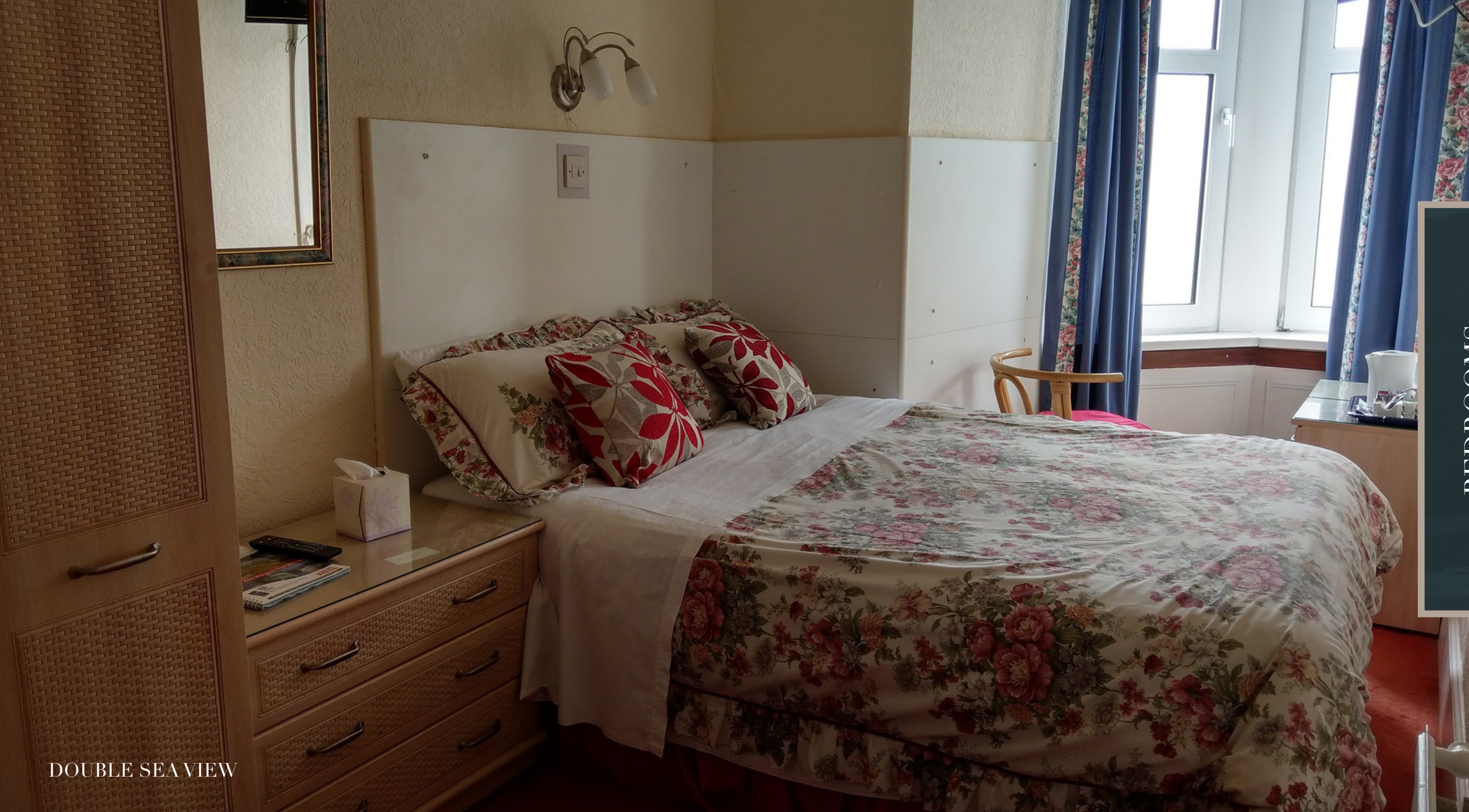
DOUBLE SEA VIEW