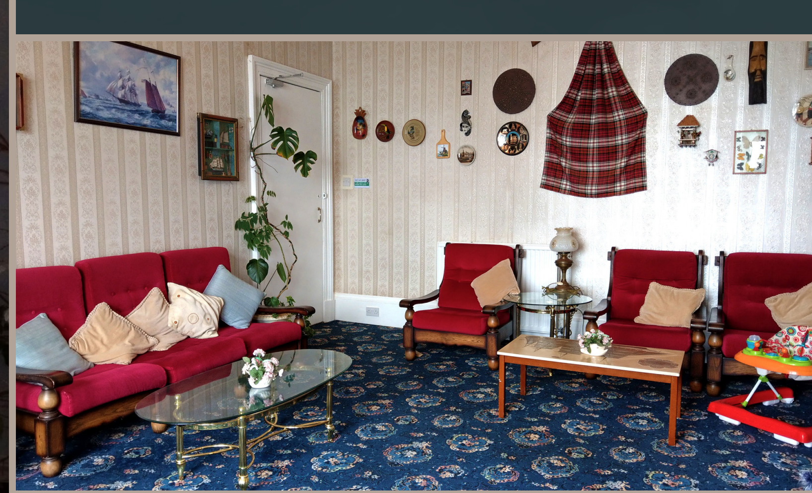
LOUNGE & DINING ROOM