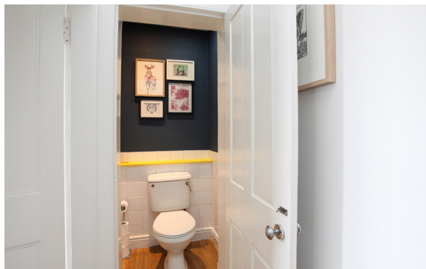
2f1, 88 Newhaven Road