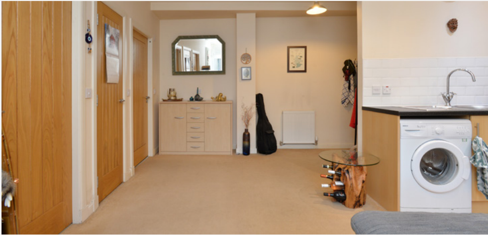
open plan living