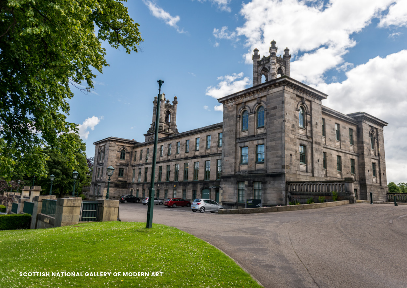
SCOTTISH NATIONAL GALLERY OF MODERN ART

Ravelston is one of Edinburgh's most sought after residential areas situated approximately one and a half miles to the North West of the city centre of Edinburgh.