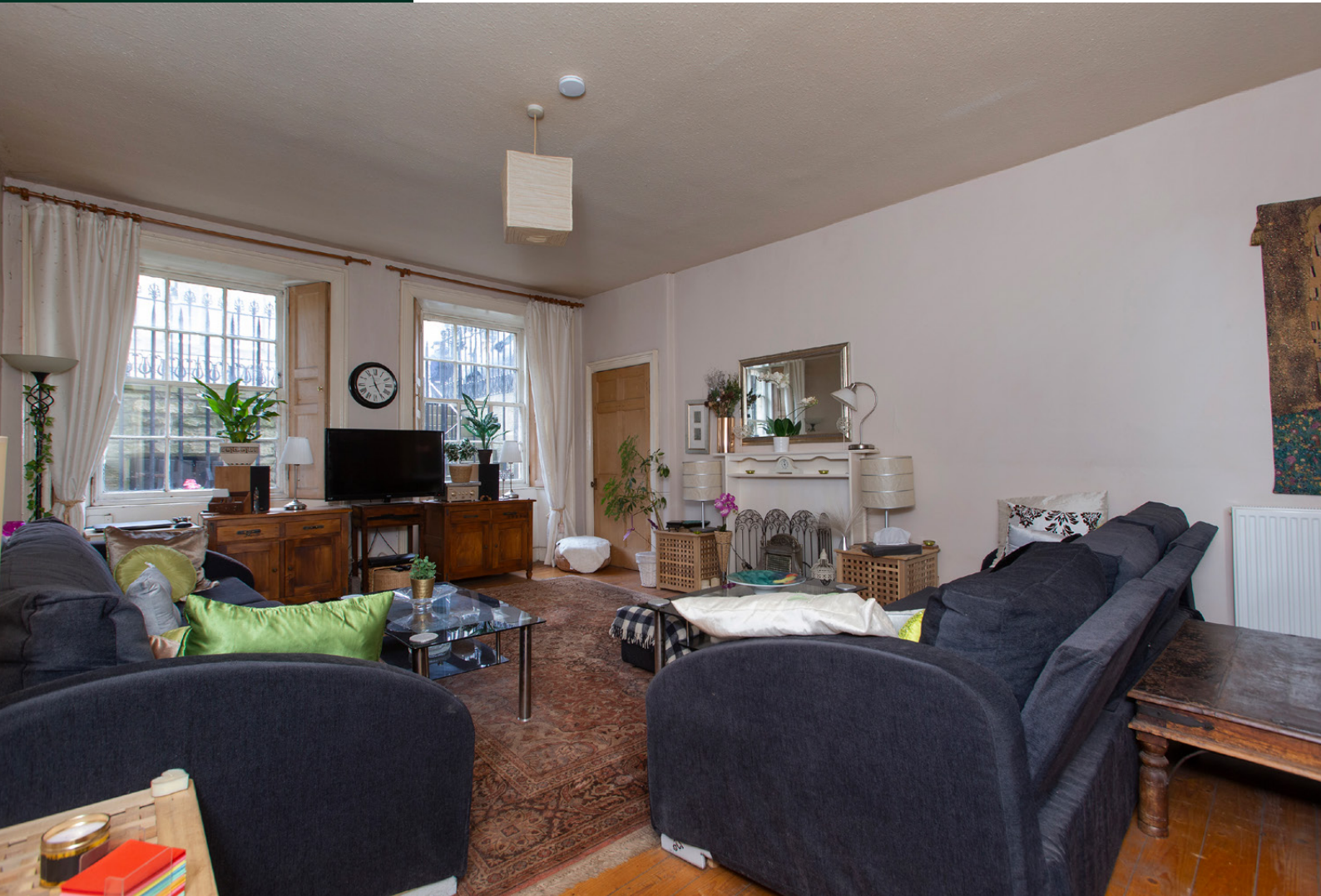
SPACIOUS TWO BEDROOM BASEMENT GARDEN FLAT