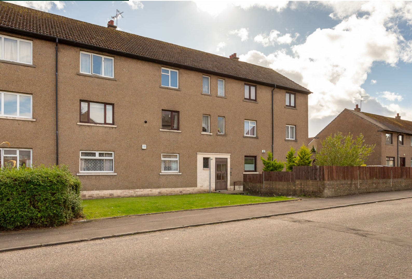
Two-double bedroom first-floor flat