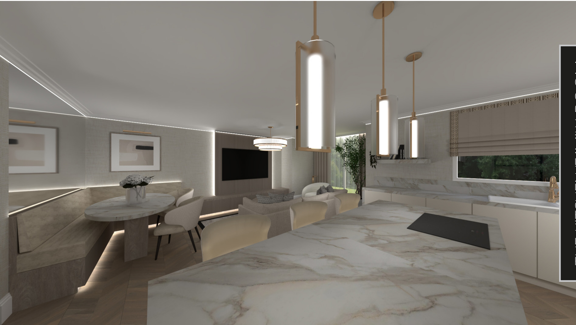
THE KITCHEN/FAMILY ROOM