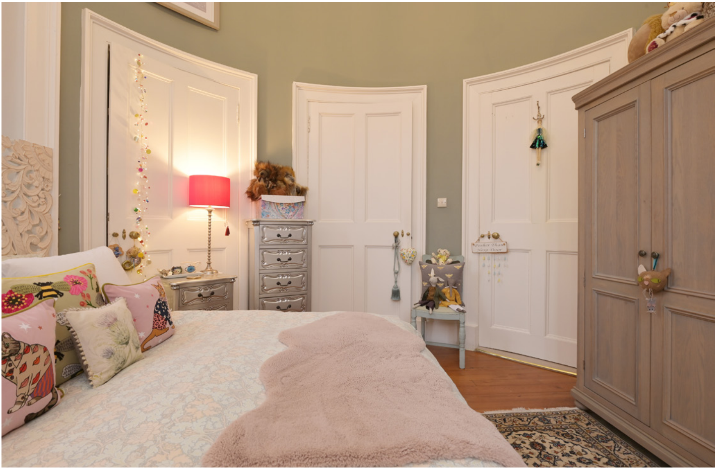
A unique round double bedroom featuring large windows with shutters and four built-in cupboards within the curved wall.