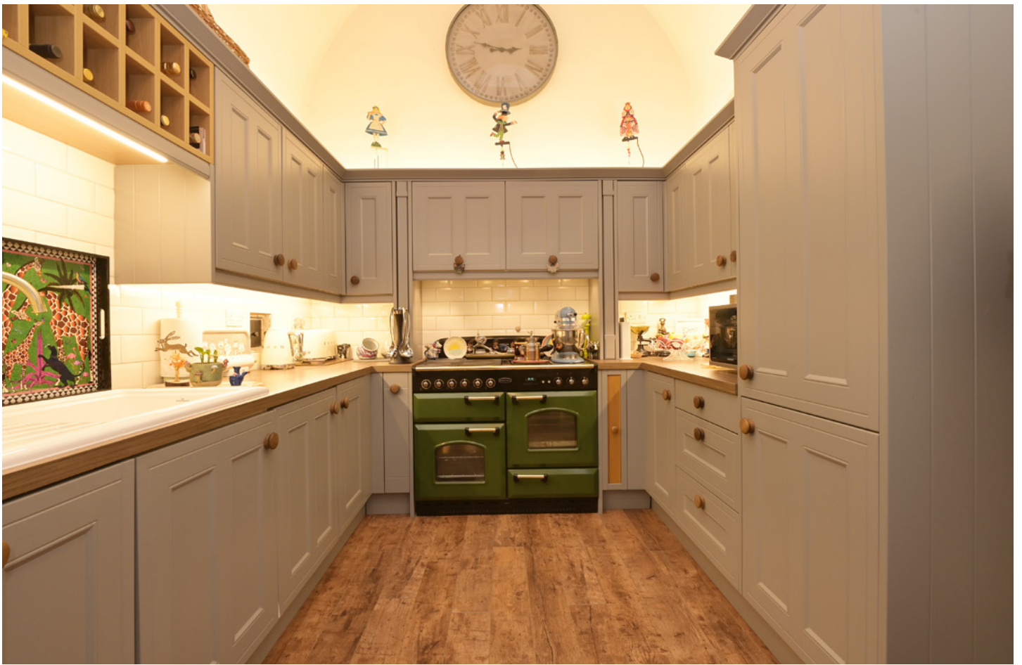
There is a fully equipped kitchen/breakfast room with a vaulted ceiling, painted shaker-style units, fitted shelving, and ample space for dining.