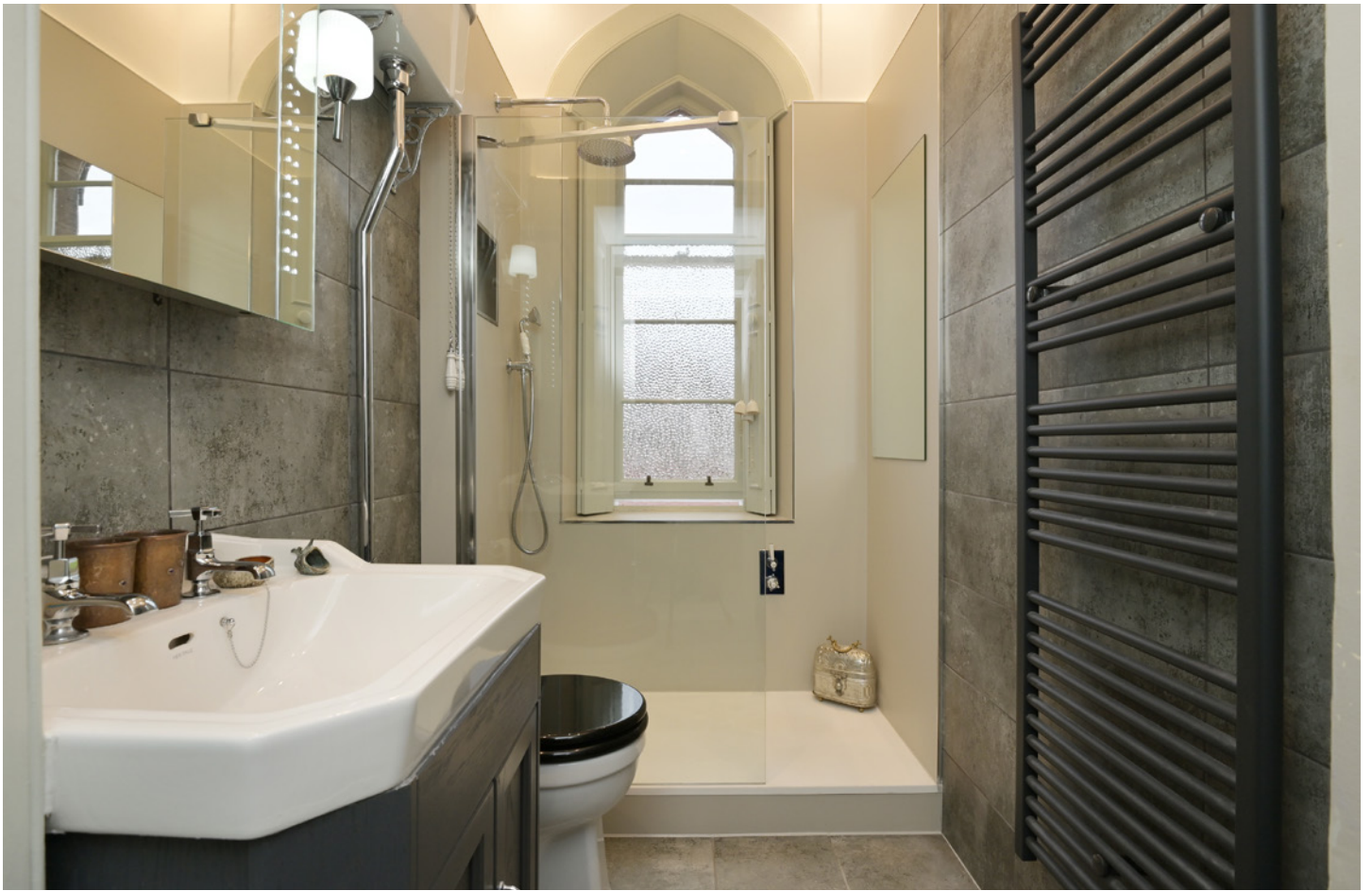
There is a modern bathroom fitted with a stylish suite, including a shower, vanity unit with a granite top, and WC.