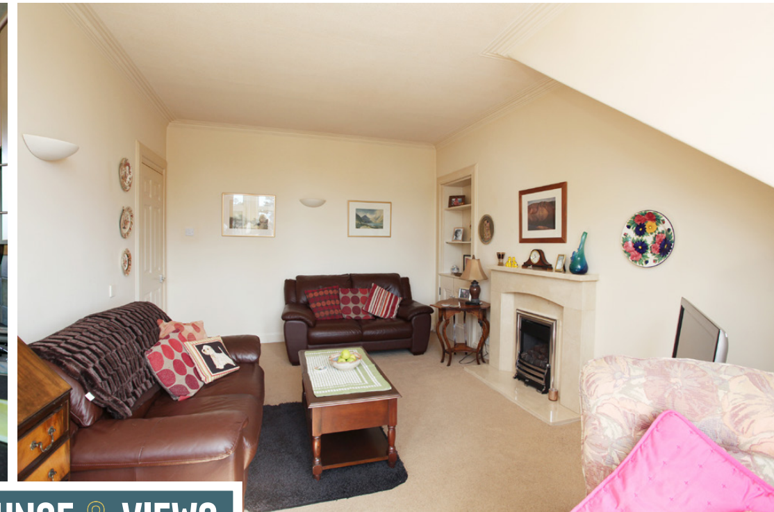
KITCHEN, LOUNGE & VIEWS