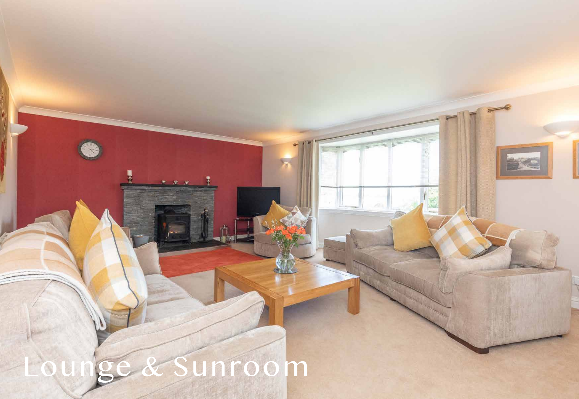
Lounge & Sunroom