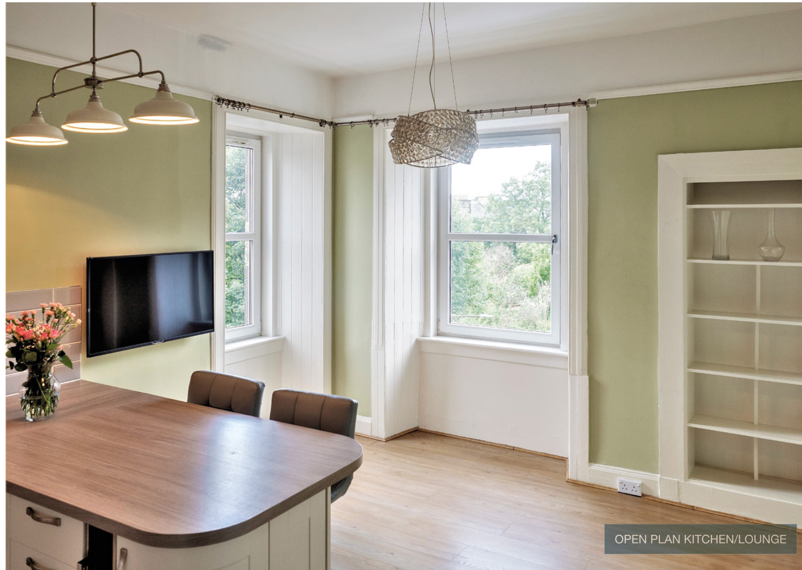
OPEN PLAN KITCHEN/LOUNGE