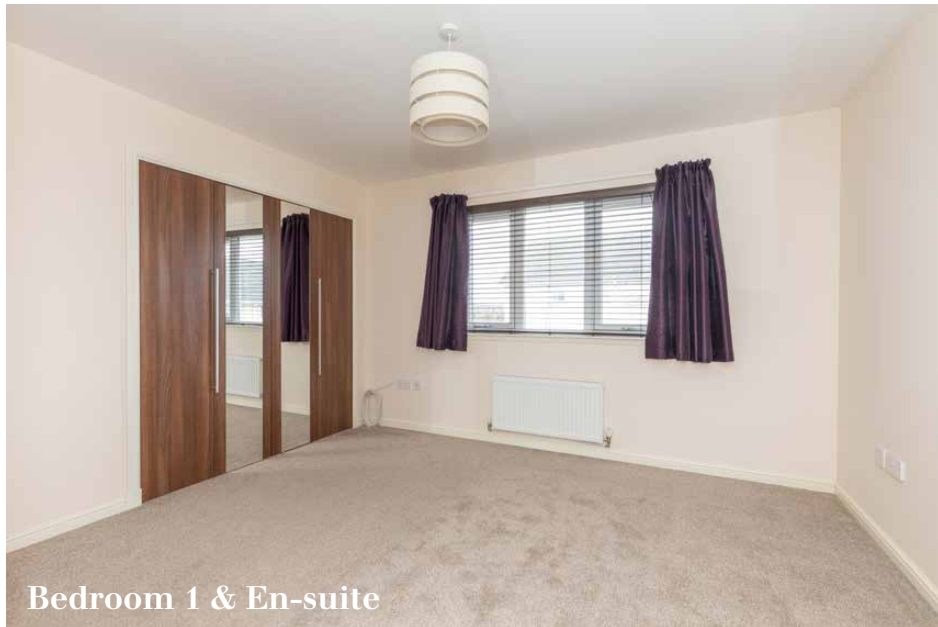
Bedroom 1 & En-suite