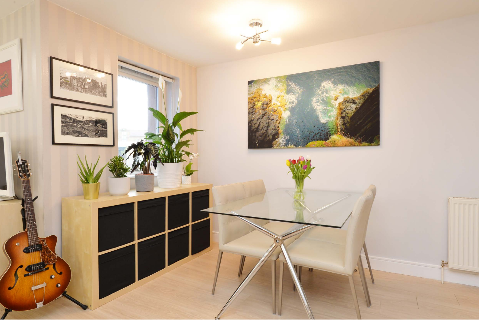
Open plan living area