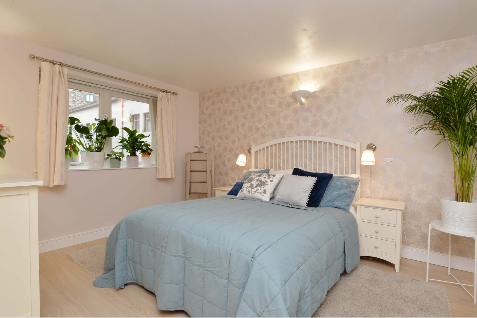
Bedroom with en-suite and walk-in wardrobe