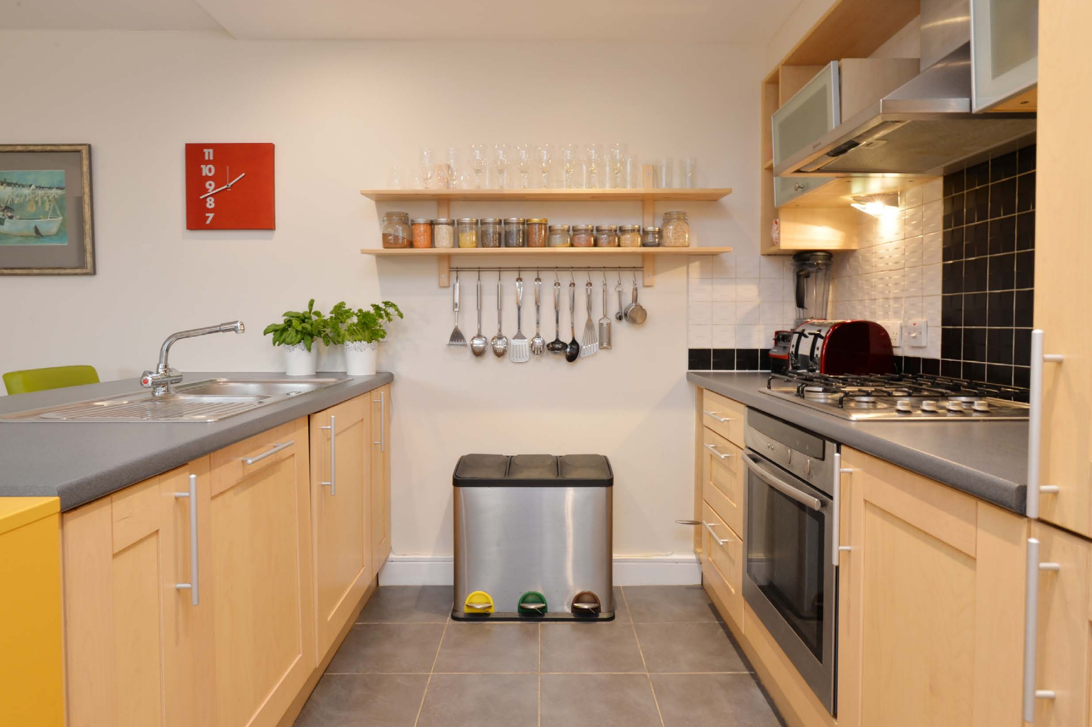
Open plan kitchen diner