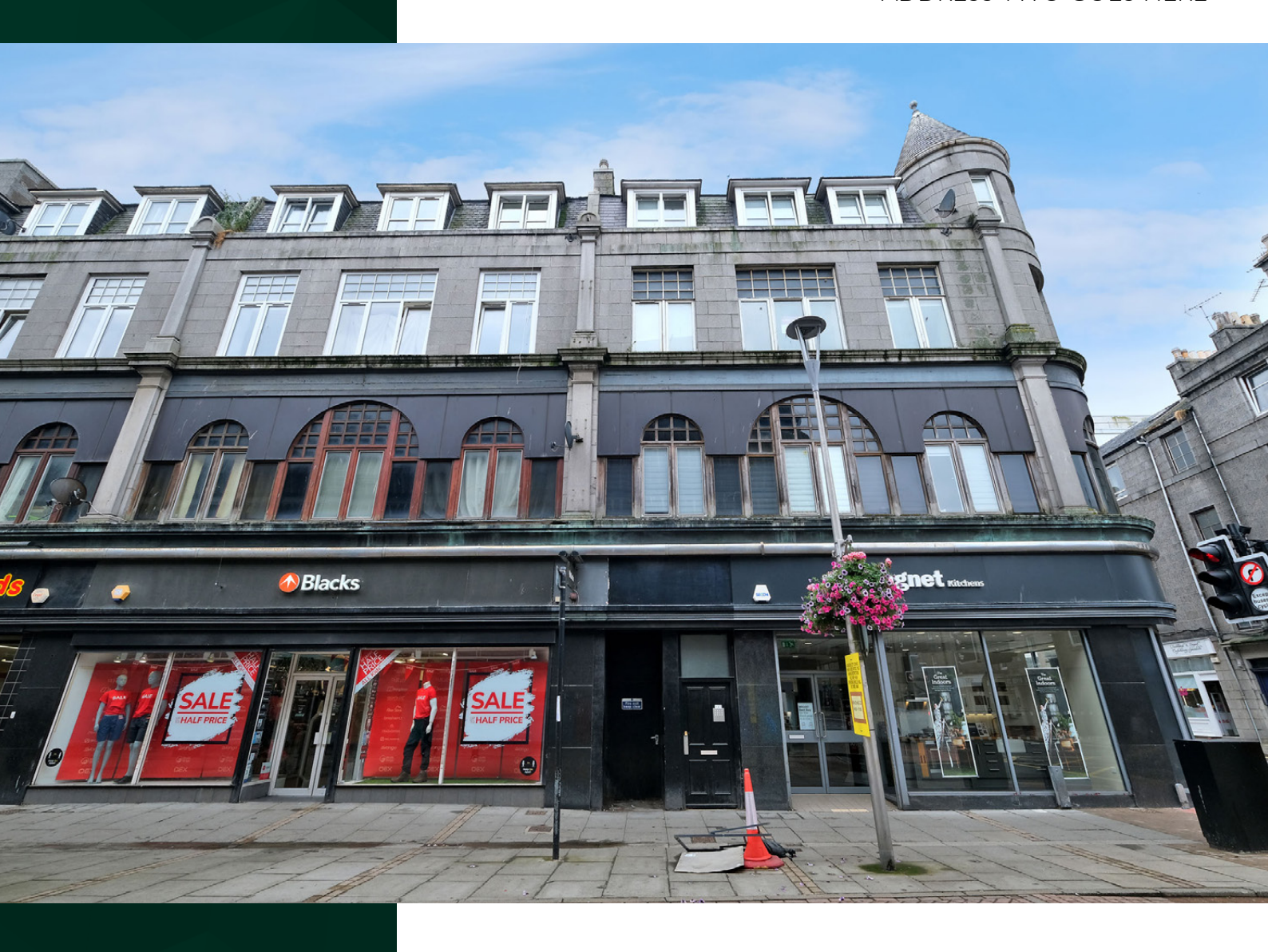
PARTIALLY FURNISHED MODERN TWO-BEDROOM FLAT