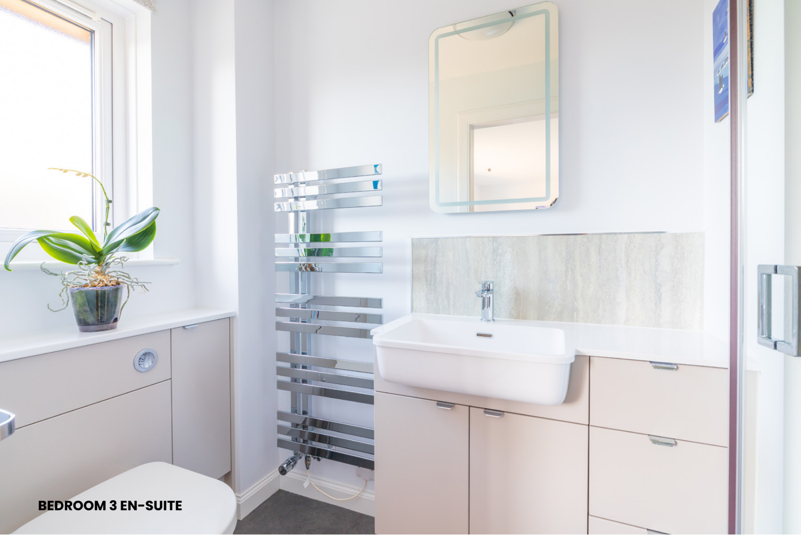
BEDROOM 3 EN-SUITE