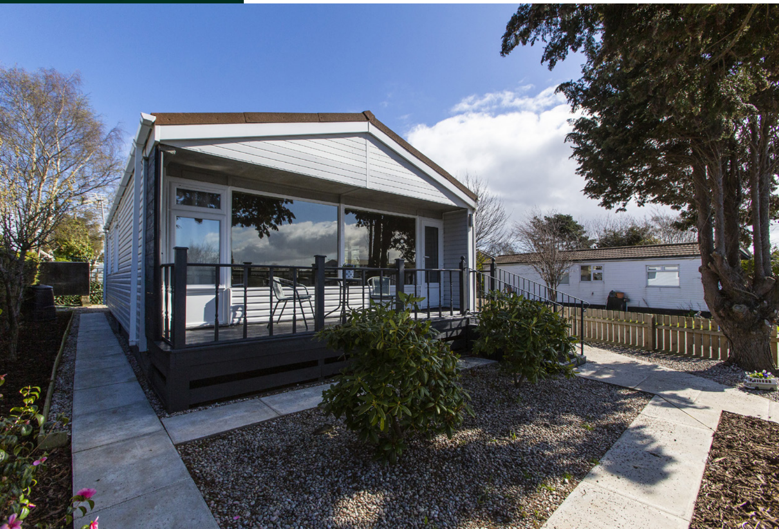
Spacious Two-Bedroom Park Home in The Nivensknowe Site

NIVENSKNOWE PARK, LOANHEAD, MIDLOTHIAN, EH20 9QA