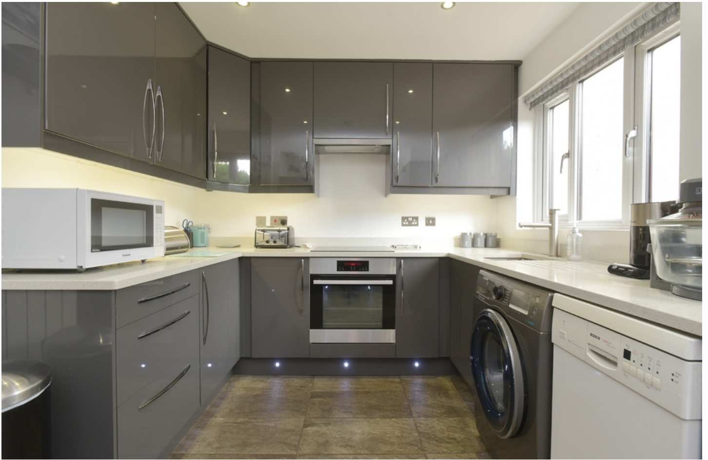
The fully equipped modern kitchen with integrated fan oven, induction hob and free-standing white goods. The kitchen is a welcoming, generously proportioned space.