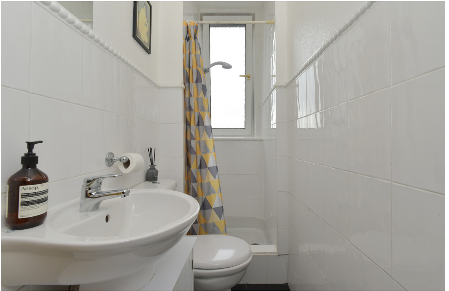
The accommodation is completed by the shower room which has natural light, partial tiling, and a white suite.