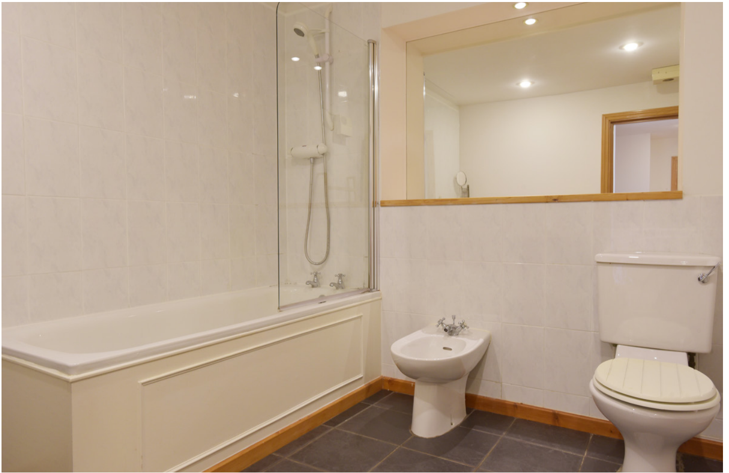
The spacious bathroom features a four-piece bath suite with WC, sink, bidet and a mains-pressure shower over the bath.