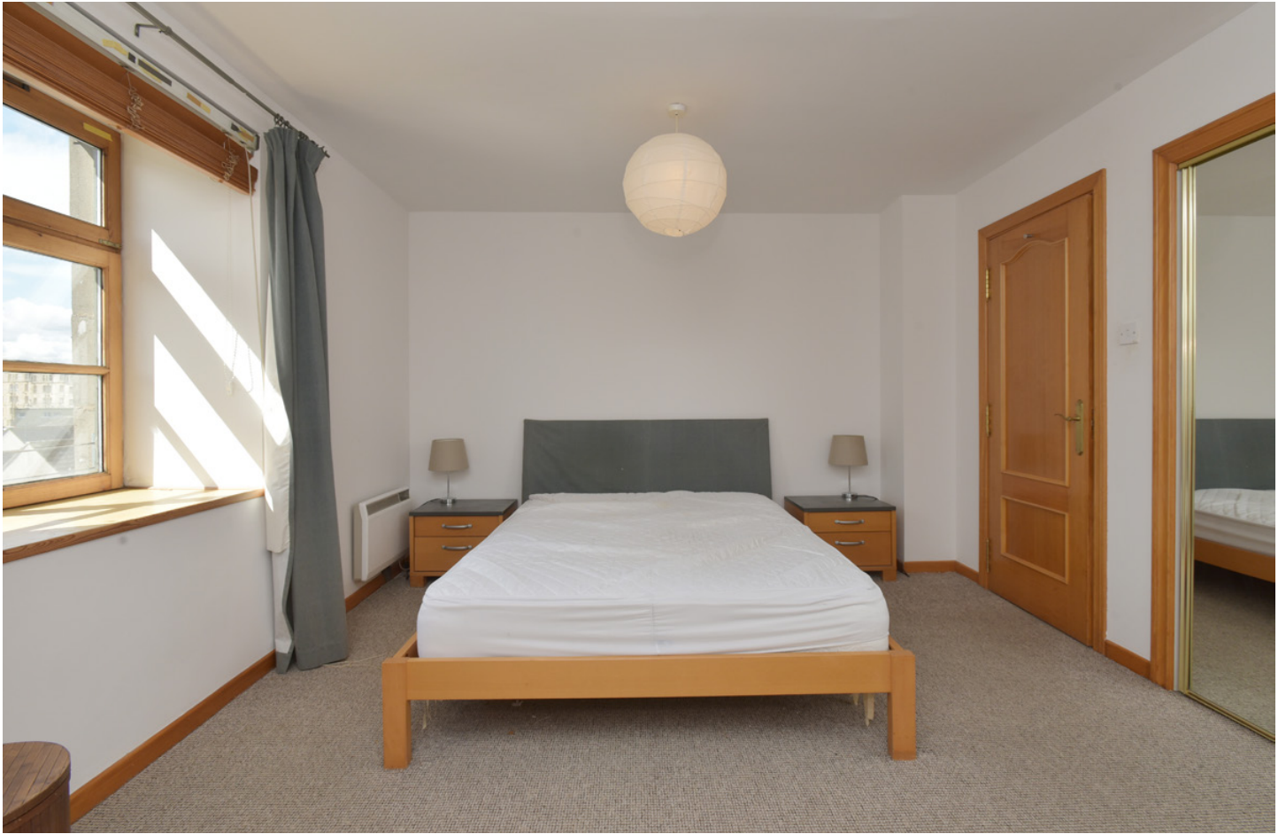
The generous double bedroom with built-in sliding wardrobes also benefits from a south facing aspect.