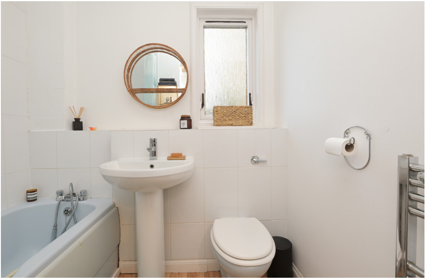
The bathroom is partially tiled and has a three-piece suite with a shower over the bath. There is a handy storage cupboard in the hall.