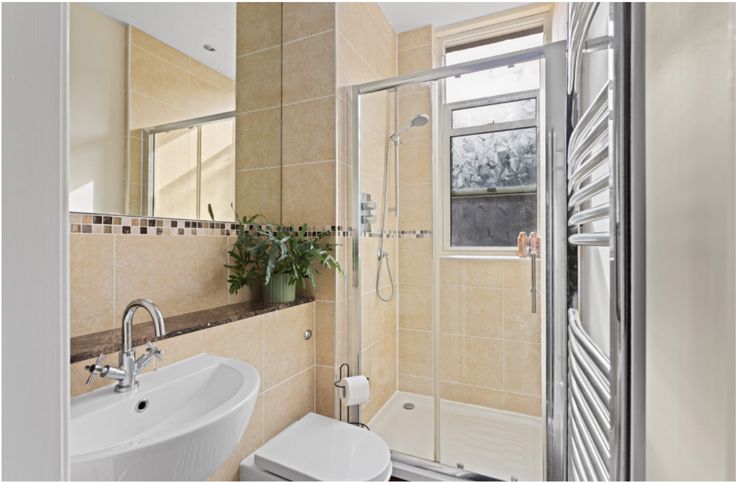
A modern three-piece bathroom suite completes the internal accommodation.