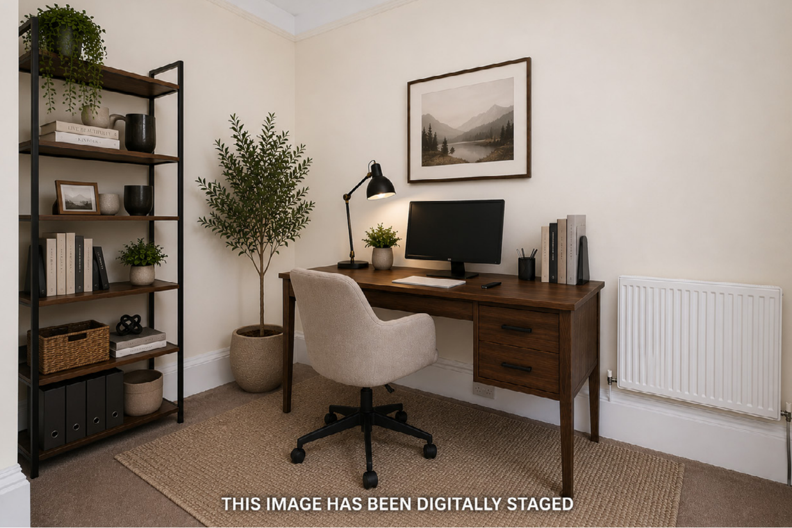
THIS IMAGE HAS BEEN DIGITALLY STAGED